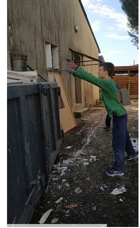
work in progress